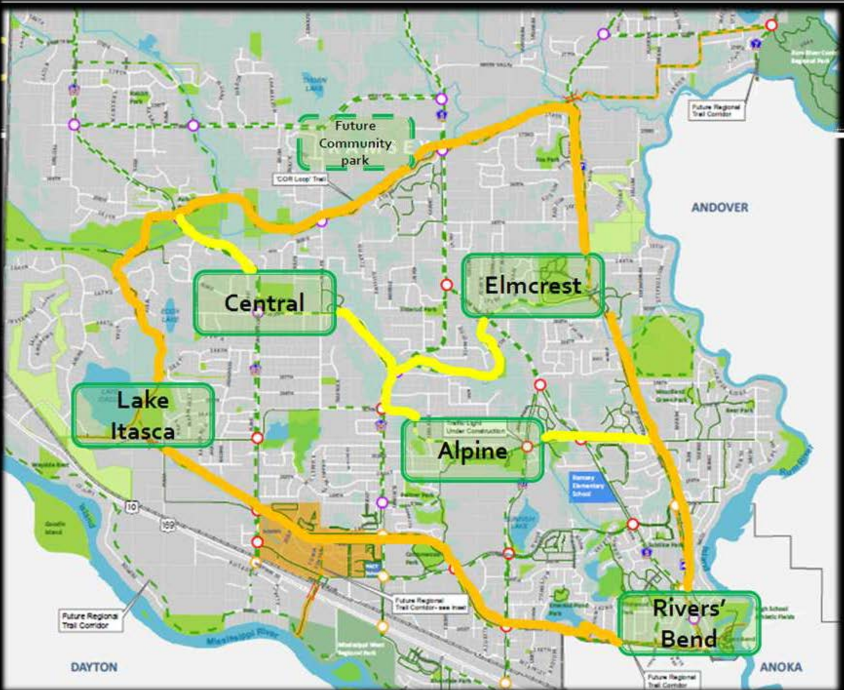
Gold/ Yellow represents priority trails within Ramsey